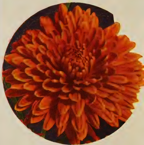
AUTUMN BEAUTY. 50c each; 3 for $1.25

6 Summer MUMS A selection that always beats the frost. All early and dependable. 6 Sure-to-Bloom Plants $2.80 (1 of each pictured)